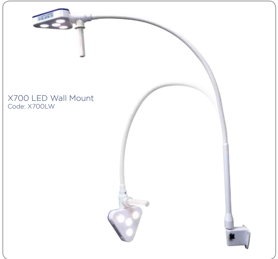
X700 LED Wall Mount Code: X700LW