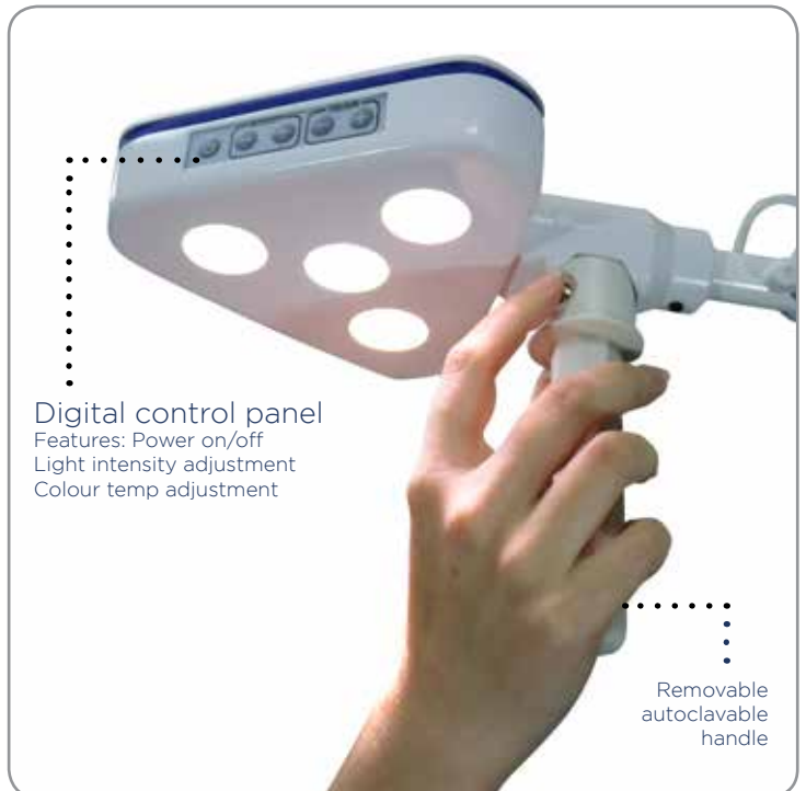
Digital control panel Features: Power on/off Light intensity adjustment Colour temp adjustment