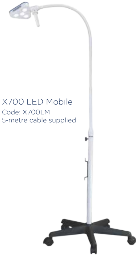
X700 LED Mobile Code: X700LM 5-metre cable supplied