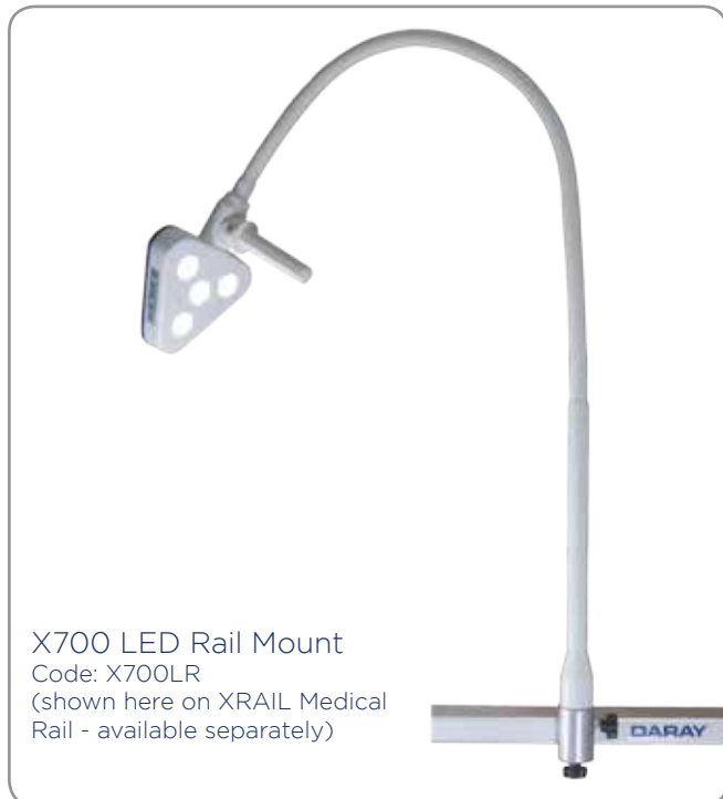
X700 LED Rail Mount Code: X700LR (shown here on XRAIL Medical Rail - available separately)